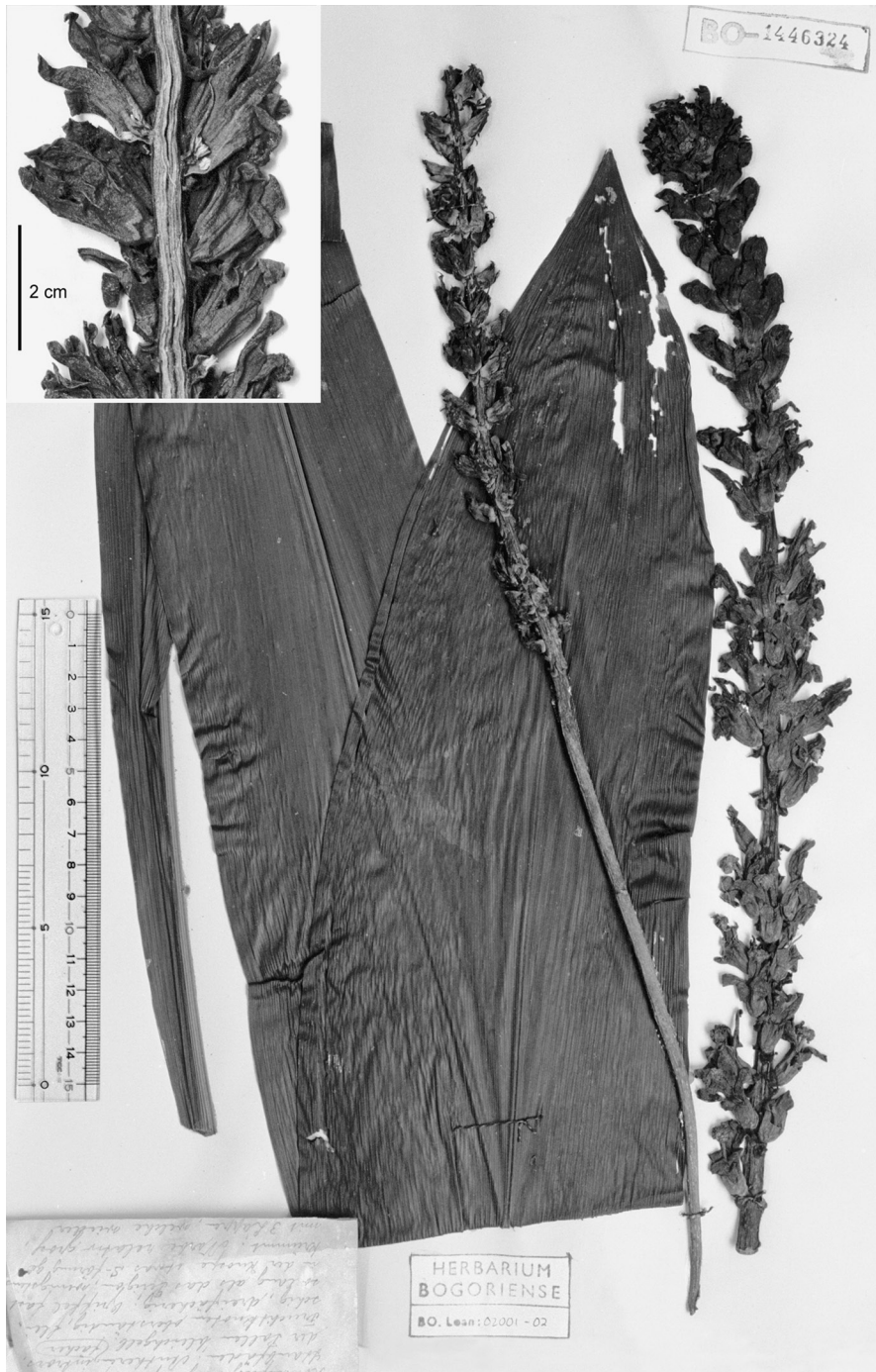
Fig. 1. Tupistra sumatrensis N. Tanaka. Holotype (Lörzing 13712, BO), and part of paratype (Galoengi 91, BO) (in inset) showing part of its inflorescence longitudinally cut. — Scale bar in inset = 2 cm.