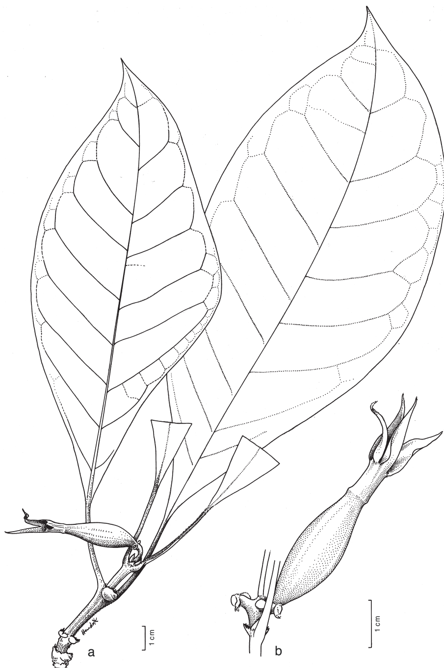
Fig. 1. Coussarea longilaciniata Delprete. a. Habit of terminal branchlet with mature fruit; b. detail of peduncle and mature fruit (all: Hahn et al. 5643).