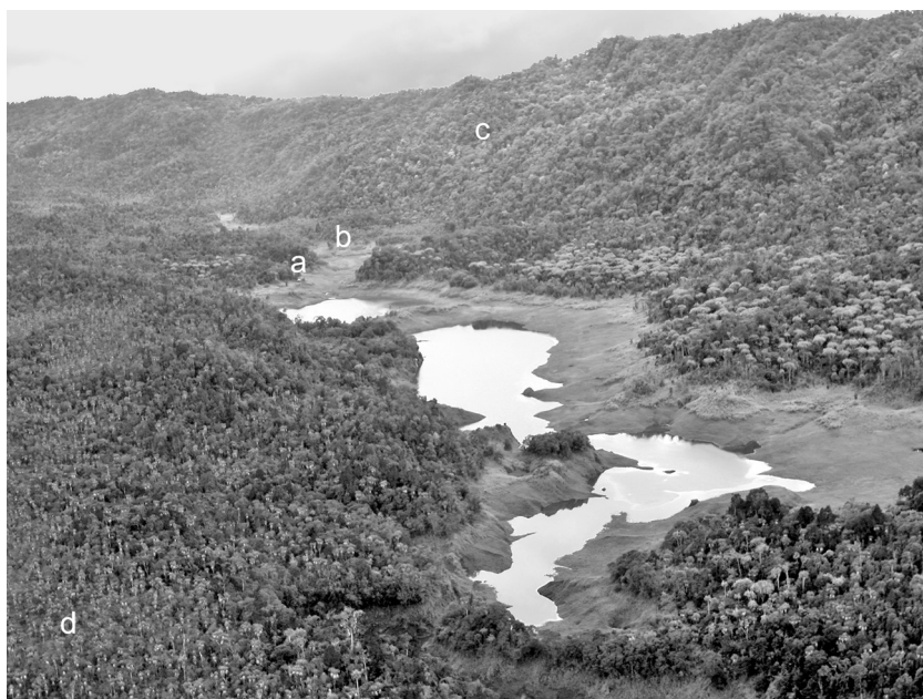
Fig. 2. Paiela (Lake Tawa, Kaijende Highlands), type locality for Pneumatopteris medlerii . Aerial view of the catchment lakes and surrounding terrain. a. Expedition bivouac; b. sinkholes; c. collection site on limestone exposures; d. Pandanus savannah to the north of camp.