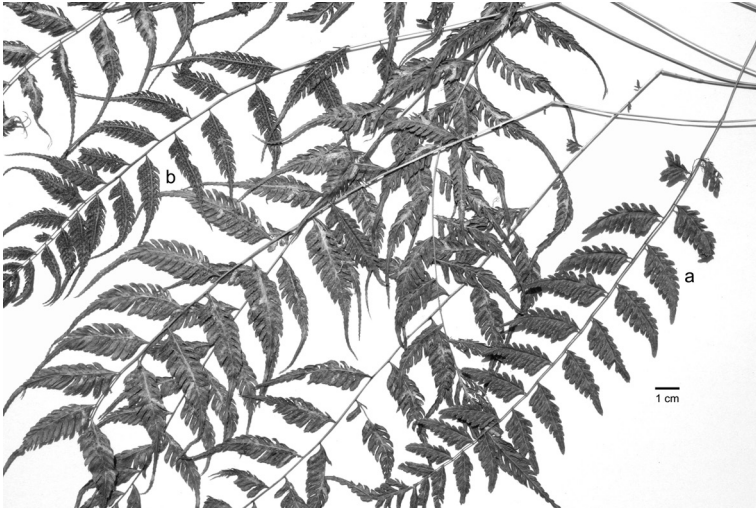
Fig. 3. Pneumatopteris medlerii W. Takeuchi. a. Juvenile pinnae; b. fertile pinnae (Takeuchi, Towati & Ama 19947).

side, lowermost 1(–3) pairs reduced, passing abruptly or gradually to 1–3(–6) rudimentary auricles on the stipe, (or without highly reduced pinnae); frond apex attenuate, pinnatisect, usually 1–2.5 cm caudate. Largest pinnae 37–57(–67) by (6–)9–14 mm, at the lamina centre separated (10–)15–24(–29) mm from adjacent segments, lanceolate, falcate, decurrent on a c. 1.5 mm stipe, never sessile, base manifestly unequal, lower