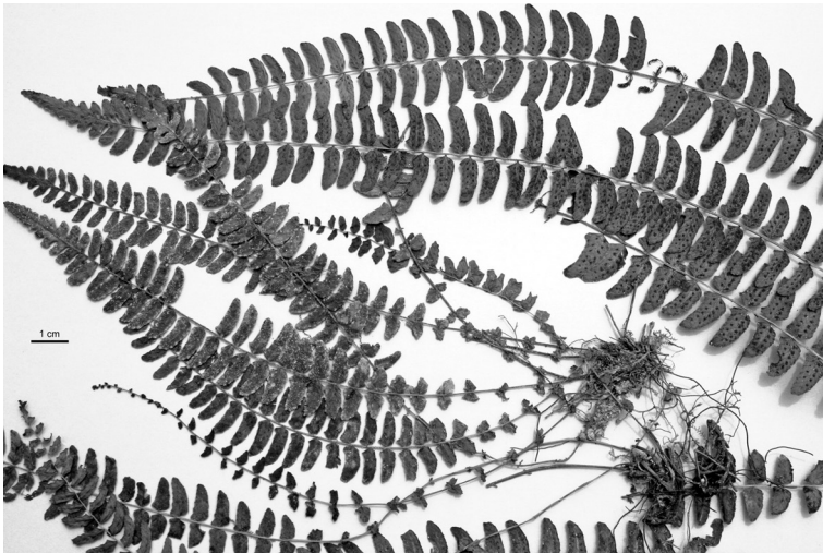
Fig. 5. Pneumatopteris nephrolepioides . Unmounted duplicate from the Karius limestone (Takeuchi, Towati & Jisaka 19239).

A distributional record was also obtained for the calciphilous P. nephrolepioides , from the Karius kegelkarst near Paiela (Takeuchi et al. 19239). This second congener