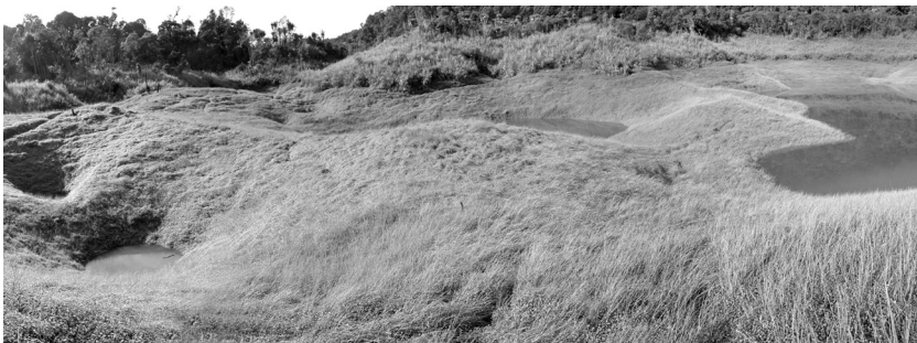
Fig. 1. Paiela. The limestone zone is perforated by sinkholes (Australian Survey Corps, 1979). During periods of high rainfall, the catchment lake-overflow disappears into a series of large funnellform holes (shown with residual water) adjacent to the bivouac. Drainage rates are very high; a new lake which formed after torrential rains was completely removed by the sinkholes after three days. An extensive subterranean plumbing probably underlies the whole district, as there are no surface outflows anywhere near the basin.

Recent explorations in the Kaijende Highlands of Enga Province (Papua New Guinea) have revealed the presence of many taxa previously unknown to science. The expeditionary discoveries include an apparently new amphibian genus (S. Richards, pers. comm.), a new mammal (C. Helgen, pers. comm.), and numerous distributional records. Pneumatopteris medlerii is the first of the botanical novelties to be presented from these multidisciplinary surveys of the Central Ranges (Fig. 1, 2).