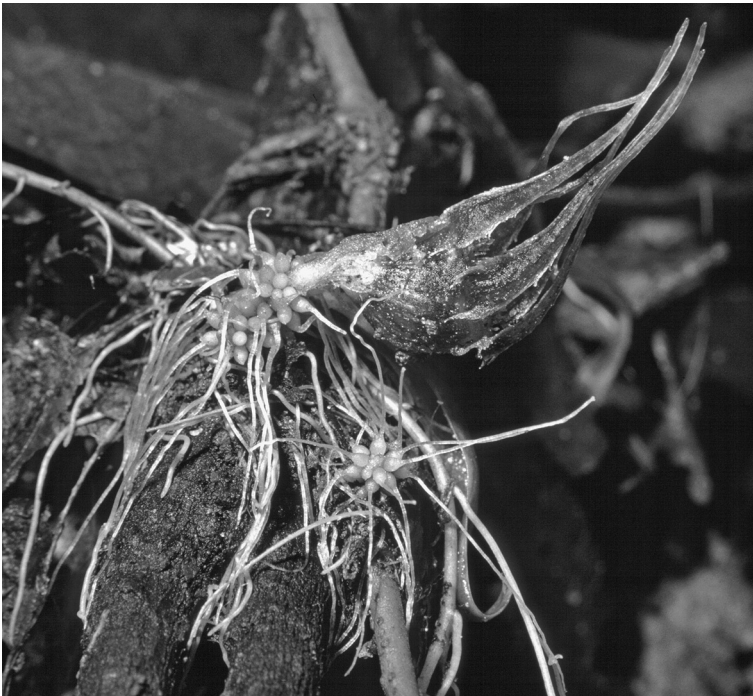
Fig. 2. Afrothismia foertheriana Th. Franke, Sainge & Agerer. Habit. (Th. Franke & M. Sainge 02/030).