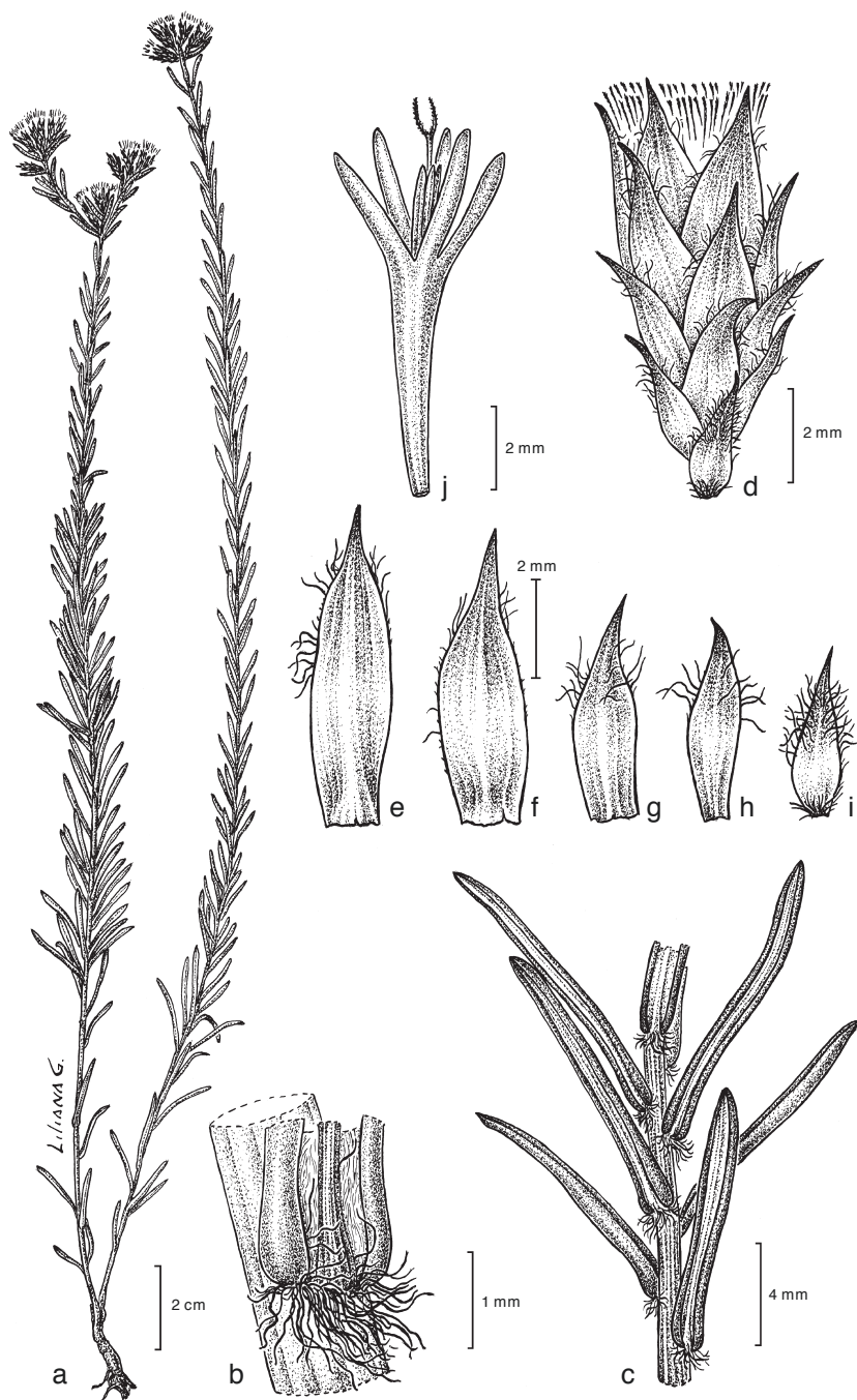
Fig. 1. Stenocephalum monticola (Mart. ex DC.) Sch.Bip. a. Habit; b. leaf blade base; c. portion of the stem; d. involucre; e, f. inner phyllaries; g. middle phyllary; h, i. outer phyllaries; j. corolla showing anthers and style (Ganev 3180, HUEFS).