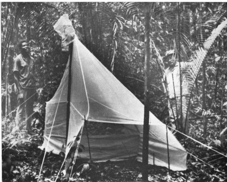
PLATE IIa. - "Malaise" trap (smaller type) in rainforest near Phedra, Suriname.