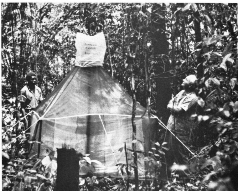
IIb. - "Malaise" trap (large type) in rainforest near Phedra, Suriname.