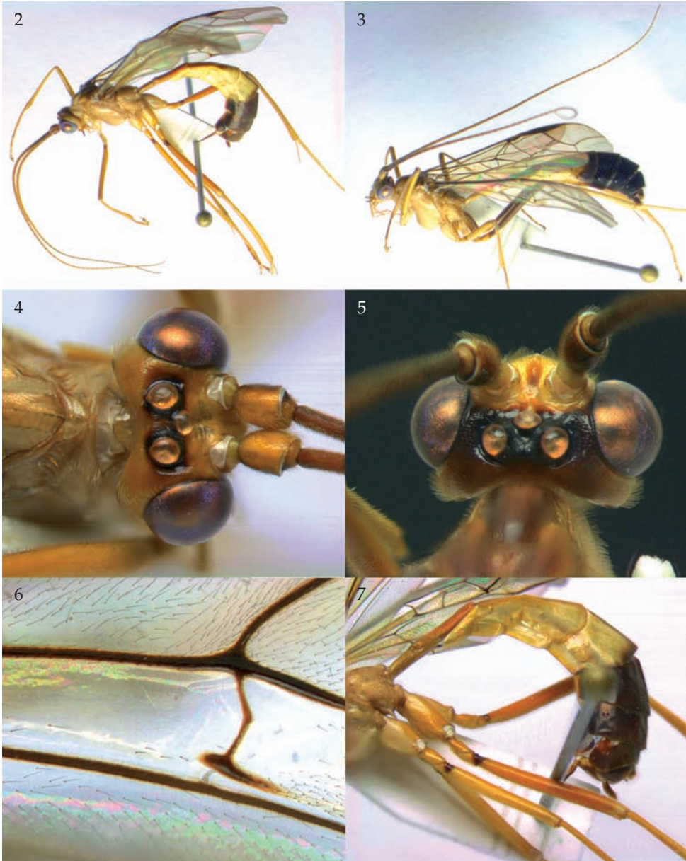
Figs 2-7, Xiphozele linneanus spec. nov., ♀, holotype, but 3, 5 of ♂, paratype. 2, 3, habitus, lateral aspect; 4, 5, head, dorsal aspect; 6, apical third of subbasal cell of fore wing and vein cu-a with sclerome, 7, metasoma, lateral aspect.

dorsally, with some coarse crenulae medially and extensively punctate-rugose ventrally; epicnemial area densely punctate dorsally; precoxal sulcus wide, coarsely reticulate-rugose (fig. 11), ventrally becoming mainly coarsely punctate and remainder of mesopleuron mainly punctulate; pleural sulcus finely crenulate; metapleuron