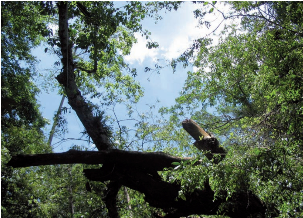
Fig. 1. Type locality of Xiphozele linneanus spec. nov.: a partly open spot near the Dong trail in the lowland rainforest of Cát Tiên National Park in South Vietnam.

Only one (out of the 35!) Malaise traps placed in April-May 2007 in the Cát Tiên National Park (South Vietnam; fig. 1) yielded specimens of the genus Xiphozele Cameron, 1906 (of the subfamily Xiphozelinae van Achterberg, 1979). It is for the first time the genus was collected during one of the expeditions and the genus was hitherto unknown from Vietnam. Specimens are attracted to light (as shown by part of the material of the