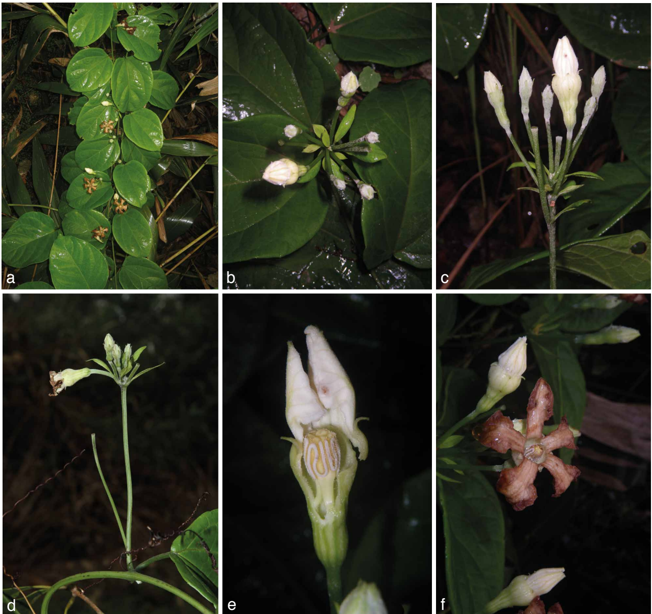
Fig. 1 Trichosanthes conferta Duyfjes, Nuraliev & Luu. a. Portion of trailing plant; b. male inflorescence; c. idem; d. idem, note pedicel of single basal male flower; e. male bud longitudinally opened showing 3 stamens; f. male flower.

Stout perennial climber, c. 10 (?) m long; leafy stem ± grooved on drying, not reddish tinged, glabrous (glabrescent from minute hairs), c. 4 mm diam; dioecious. Probract absent, but a brown hairy wart c. 2 mm diam present (Fig. 2). Tendrils 3-branched, one branch strongest, point of branching c. 2 cm from the base, brown hairy, hairs c. 0.5 mm long, glabrescent. Leaves : petiole stout, hairy, c. 8 cm long, c. 3 mm diam; lamina brown on drying,