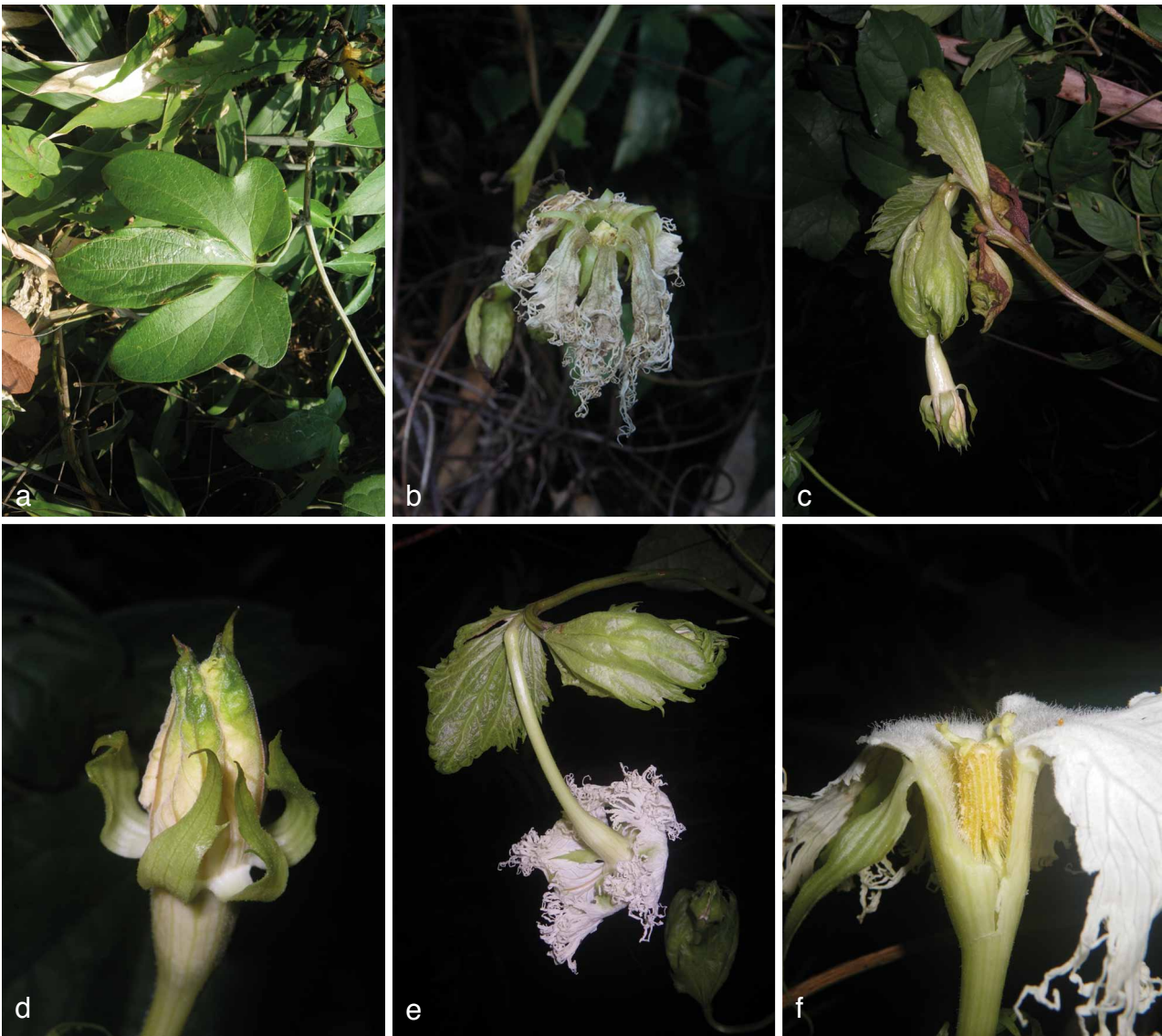
Fig. 3 a, b. Trichosanthes epibracteata Duyfjes & Nuraliev. a. Leaf; b. male flower. — c–f. Trichosanthes laceribracteata Hayata. c. Male inflorescence; d. detail of male bud; e. male flower; f. idem, longitudinally opened, showing hairy tube inside and prolongations of the connectives. — Photos: Maxim Nuraliev.

(sub)coriaceous, deeply 5-lobed to 1/2–2/3 deep, outer lobes smaller, in outline subcircular, 14–17 cm diam, finely bullate and hairy on the veins above, densely hairy all over beneath, glands absent, cystoliths not obvious, base deeply cordate, margin entire, apex of lobes long acute-acuminate; veins and veinlets sunk above, distinctly raised beneath. Male raceme finely brown hairy, co-axillary at the node or slightly adnate to base of peduncle c. 80 mm long, the flower not present in the material; peduncle 8–9 cm long, c. 3 mm thick, about halfway with 1–3 sterile bracts up to 1.5 cm long; rachis not thickened, 6–12 cm long, 2.5–3 mm thick, c. 10-flowered; bracts persistent, inserted on the pedicel 1–2 cm from the base, elliptic, 2–2.5 by 1–1.2 cm, margin subentire, glands numerous. Male flowers : brown hairy; pedicel 20–30 mm long, persistent, with bract inserted at c. 2/3 from the base; receptacle tube (25–)30 mm long, at throat c. 7 mm wide, bulging to 10 mm wide above the middle, at base slightly broadened where demarcated with the pedicel; sepals long-triangular to lanceolate, c. 7 mm long, entire, petals white, obovate or obovate-oblong, 40–50 mm long including threads c. 20 mm long; synandrium not seen. Female flower, fruit, and seed not known.