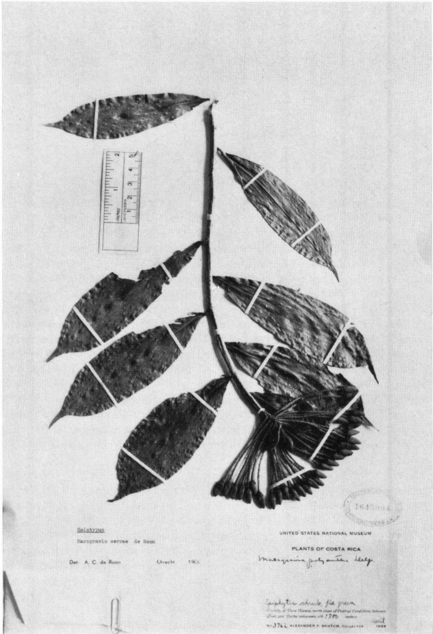
Plate 1. Marcgravia serrae de Roon