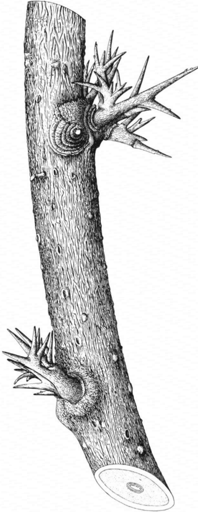
Fig. 2. Stem thorns on the stem of an Elaeagnus liane (West Java, Tjibodas; VAN STEENIS 11162), \times 1/2 .

Note. Field notes. Climber or scrambling shrub, to 30 m high. Flowers grey green, white, yellow, very fragrant. Fruit red, fleshy.