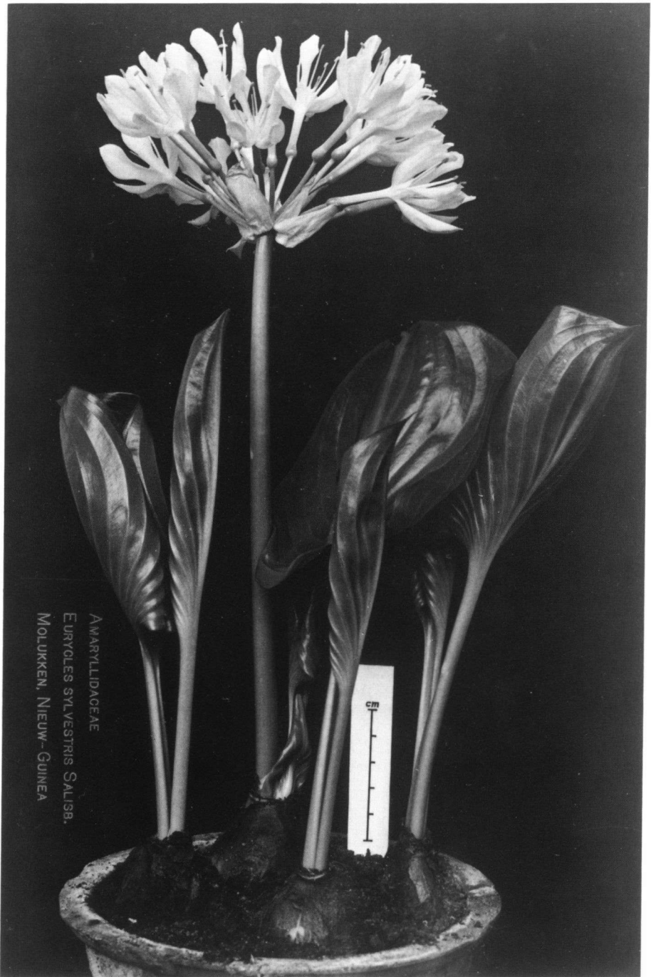
Fig. 3. Proiphys amboinensis (L.) Herbert. Cultivated in the Hortus Botanicus Leiden, 1961.