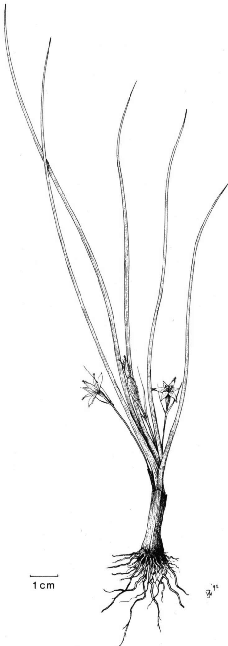
Fig. 6. Hypoxis aurea Lour. Flowering plant (Brass 11783).

Native of Colombia; cultivated as an ornamental. Leaf 1 per bulb; umbel 6–10-flowered; flowers fragrant; false corona yellow.