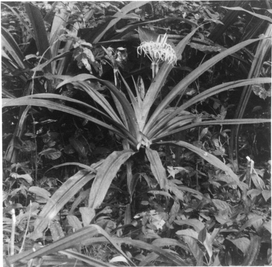
Fig. 1. Crinum asiaticum L. Habit of flowering plant. New Guinea, bank of Merau R., NE of Merauke, Irian Jaya (Photograph P. van Royen, 1954).

Crinum rumphii Merr., Interpr. Rumph. Herb. Amboin. (1917) 141. — Type: Robinson Pl. Rumph. Amb. 131 , Ambon.