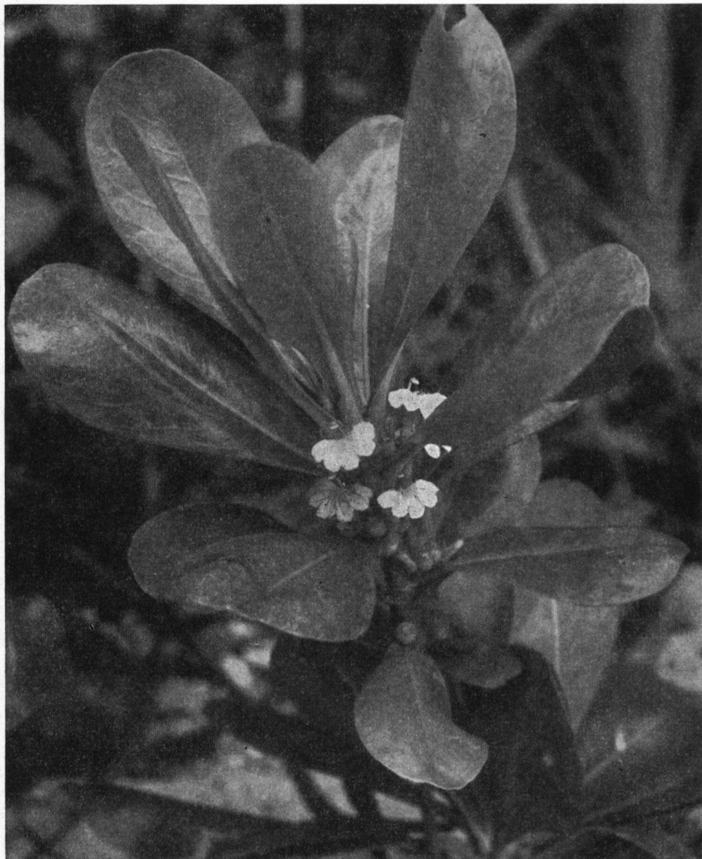
Fig. 3. Scaevola sericea (MILL.) KRAUSE in flower and fruit, Ujung Genteng (SW. Java).

long, few-flowered, glabrous (to densely woolly pubescent); peduncle c. 1 cm long. Bracts persistent, narrowly triangular, up to 3 mm long, white-pilose in the axils. Flowers 2–2½ cm long, glabrous or (specially the corolla) more or less densely appressed-pubescent, scentless. Calyx-lobes linear to narrowly elliptic, (1½–)2½–5(–15) by ½(–5) mm, blunt,