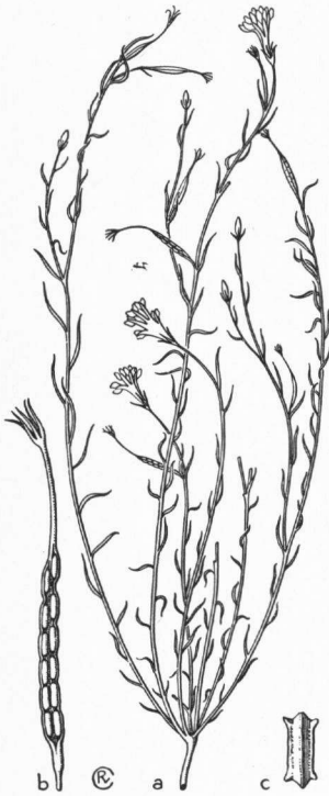
Fig. 2. Lechenaultia filiformis R. BR. a. Habit, b. fruit, c. seed ( a \times \frac{3}{4} , b \times 3 , c \times \frac{7}{12} ; a VAN ROYEN 5054, b–c BUWALDA 5527).

Distr. About 20 spp. , all but the present one restricted to Australia.