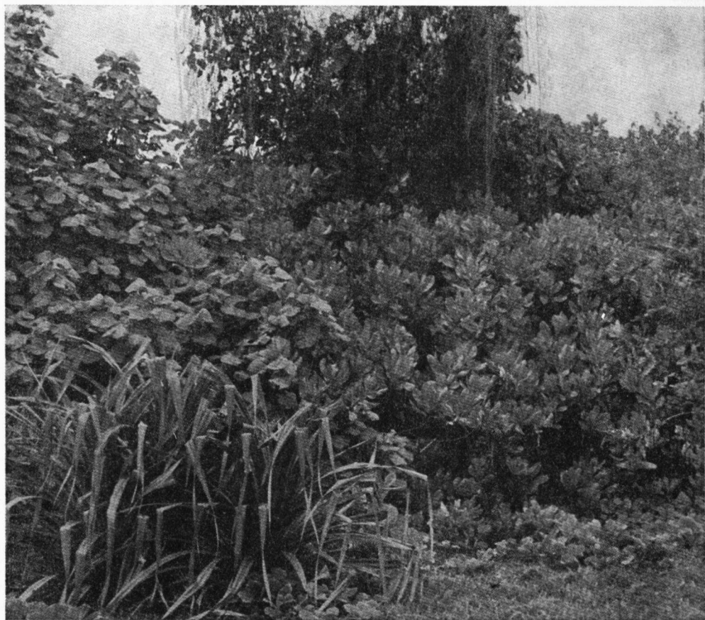
Fig. 4. Beach vegetation on the westcoast of Humboldt Bay, West New Guinea; on the right Scaevola Sericea VAHL, to the left Hibiscus tiliaceus L. and Pandanus sp., in the background Terminalia catappa L. with Cassytha filiformis L. (Photogr. L. VAN DER HAMMEN, 1954).

Vern. Sea-lettuce tree , E, strand ossetong , D, ambong-ambong , ambung-ambung , among-among , běruwas laut , buwas-buwas laut , gabusan , kaju