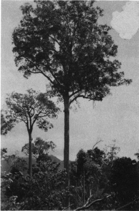
Fig. 2. Ctenolophon parvifolius OLIVER. A large mature tree at Dolok Puhutan Lajan, Tapanuli, E. Central Sumatra (Photo G.A.L. DE HAAN, 1939; coll. no. 697).

dangling from a filiform columella (10–)15–20 mm long; hilum apical, slightly protruding from testa, obtriangular, 4–7 by 2–2.5 mm; ariloid from slightly above the base up to around the hilum, oblong triangular, up to 5 by 5 mm, with hair-like papillae which are reddish when dry, surrounded by a gelatinous transparent layer. Testa 0.1–0.2 mm thick, outer layer smooth, crustaceous, dark olive-brown to purple black when dry, sometimes fissured, finally covered by a thin membrane; second and third layer reddish-brown, free from the outer wall. Endosperm fleshy, spongy. Embryo stout; cotyledons elliptic to obovate, 8–10.5 by 4.7–5 mm; radicle (1–)2–2.5 mm long.