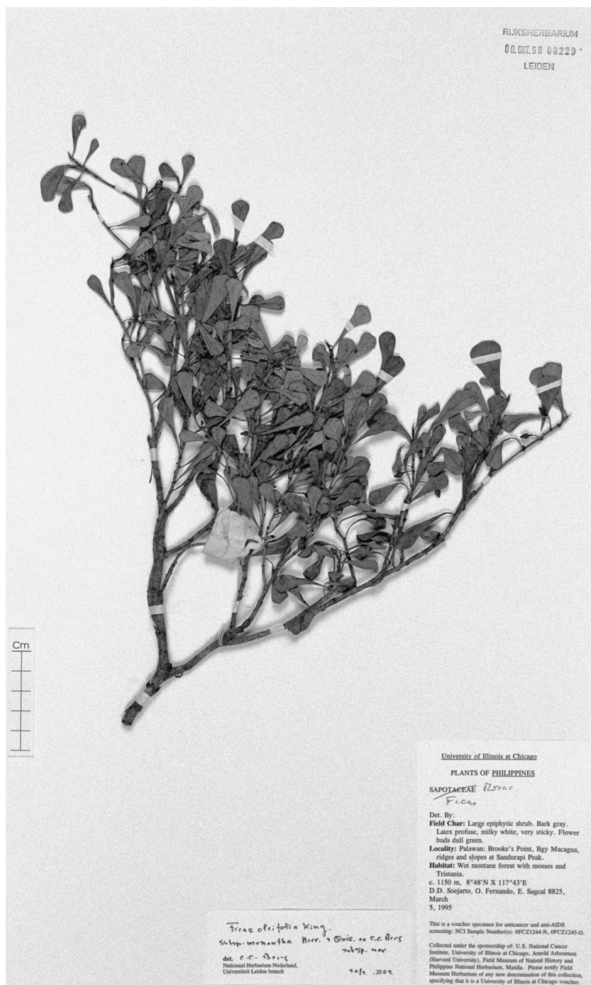
Fig. 5. Ficus oleifolia King subsp. monantha Merr. & Quisumb. ex C.C. Berg. Leafy twigs with figs (Soejarto et al. 8825, L), Philippines, Palawan, Brooke's Point, 1150 m, 7 March 1995.