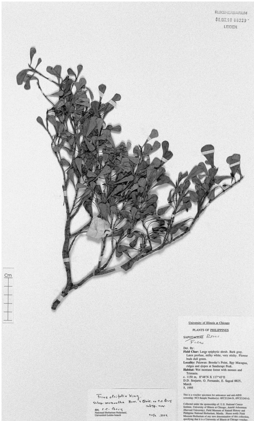
Fig. 5. Ficus oleifolia King subsp. monantha Merr. & Quisumb. ex C.C. Berg. Leafy twigs with figs (Soejarto et al. 8825, L), Philippines, Palawan, Brooke's Point, 1150 m, 7 March 1995.