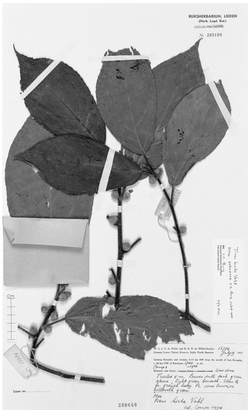
Fig. 3. Ficus hirta Vahl subsp. ochracea C.C. Berg. Leafy twigs with figs ( De Wilde & De Wilde-Duyffjes 13774, L), Indonesia, Sumatra, Aceh, Gunung Leuser Nature Reserve, 1700 m, 19 July 1972.