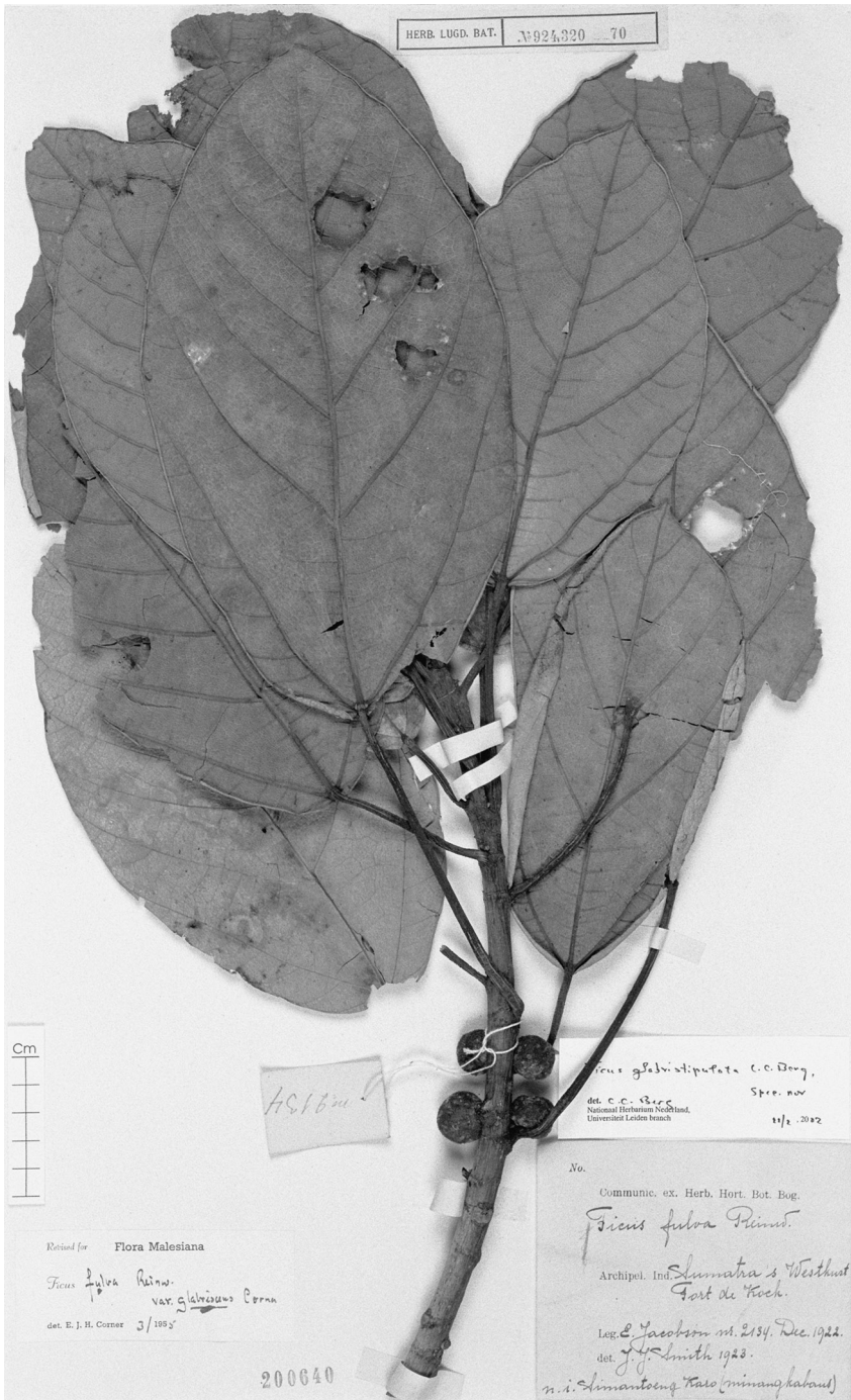
Fig. 2. Ficus glabristipulata C.C. Berg. Leafy twig with figs (Jacobson 2134, L), Indonesia, Sumatra, 'Fort de Kock', Dec. 1922.