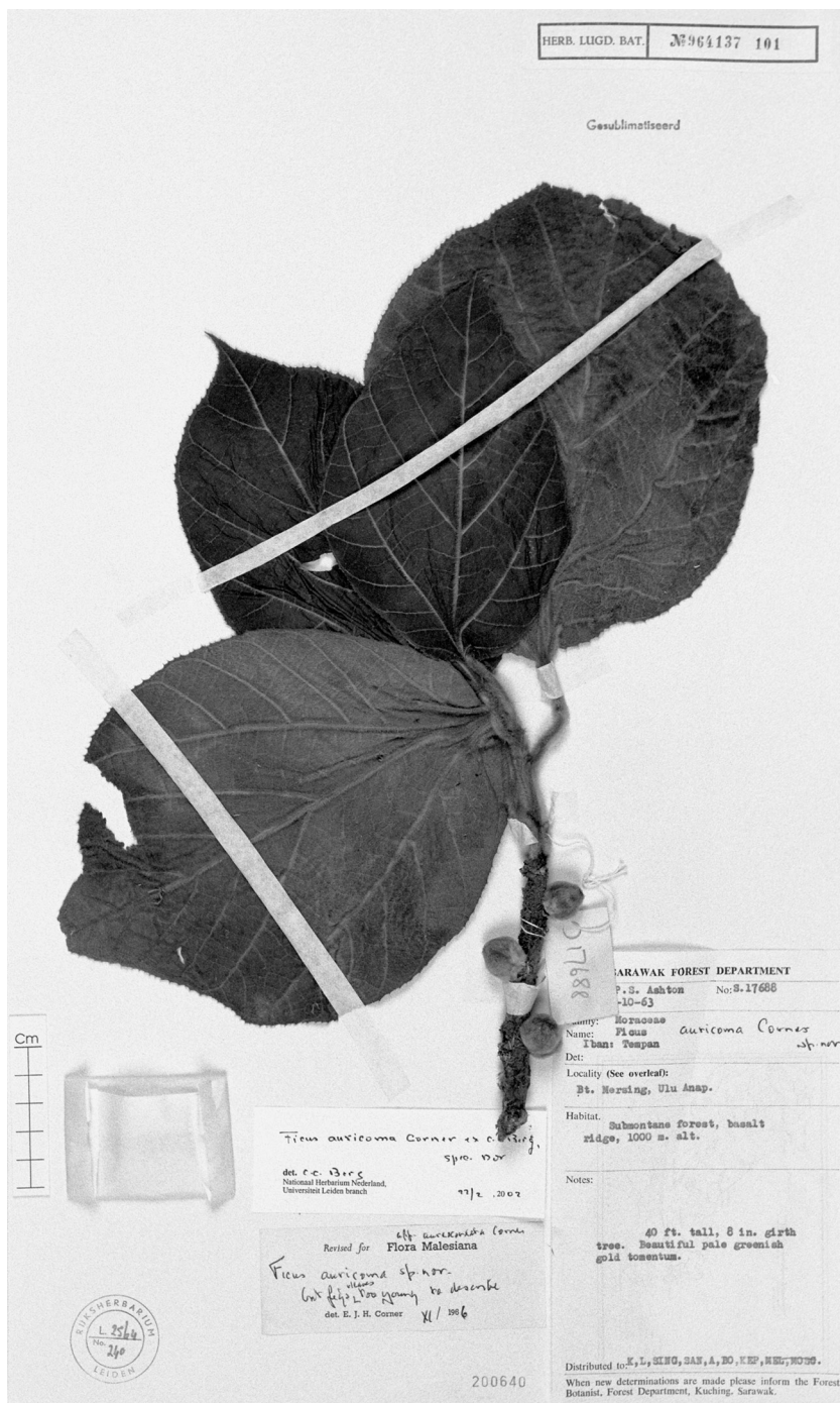
Fig. 1. Ficus auricoma Corner ex C.C. Berg. Leafy twig and figs on previous season's growth (Ashton S 17688, L), Malaysia, Sarawak, Bt. Mersing, Ulu Anap, 5 Oct. 1963.