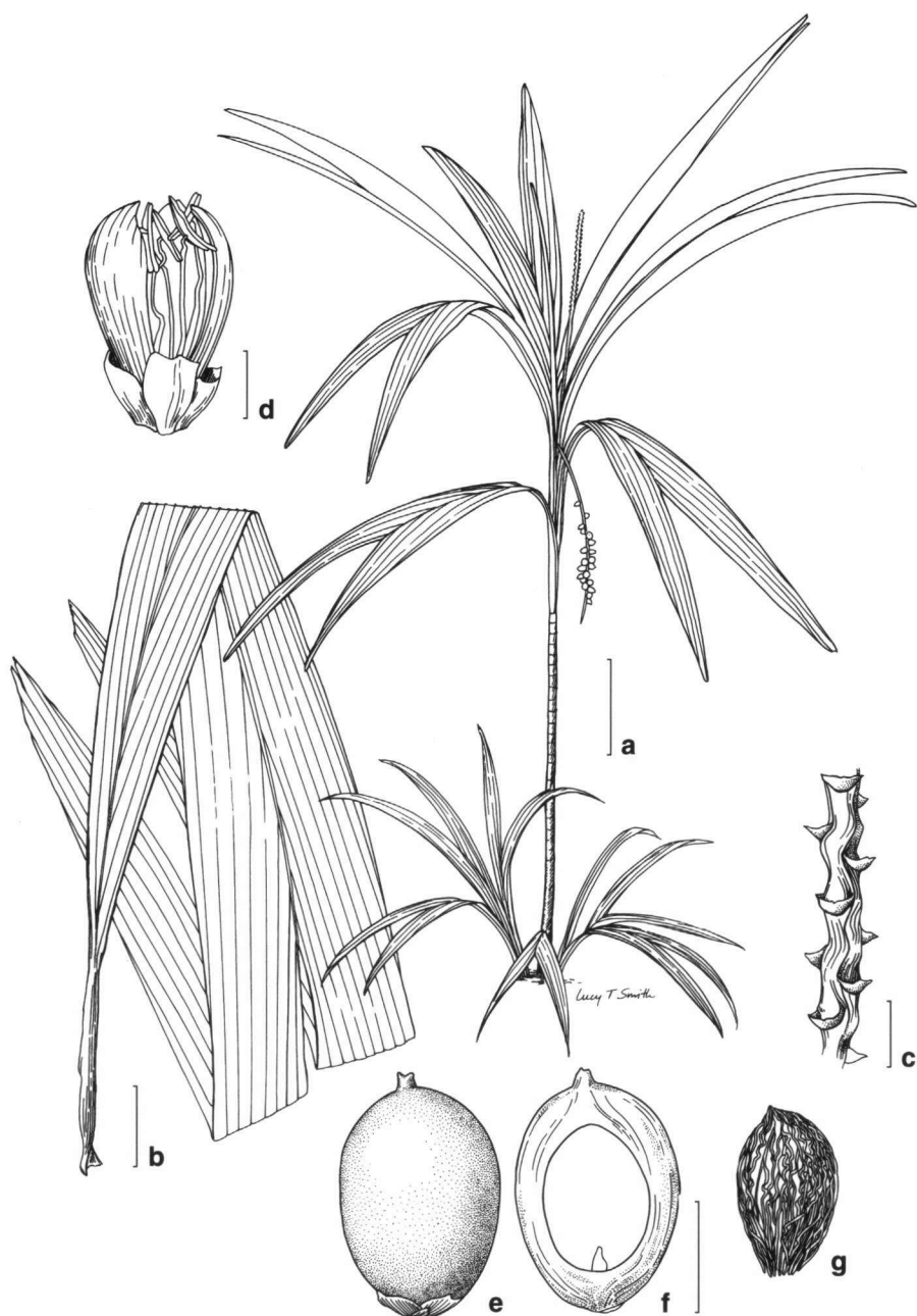
Fig. 4. Calyptrcalyx yamutumene . Dowe & M.D. Ferrero. a. Habit, with dominant stem and basal sucker; b. leaf; c. portion of rachilla with floral bracts; d. staminate flower; e. fruit; f. fruit in longitudinal section; g. fruit with epicarp removed to reveal mesocarp fibres. — Scale bars: a = 40 cm; b = 5 cm; c = 4 mm; d = 1 mm; e–g = 8 mm (from Dowe & Ferrero 508). Drawing by Lucy T. Smith.