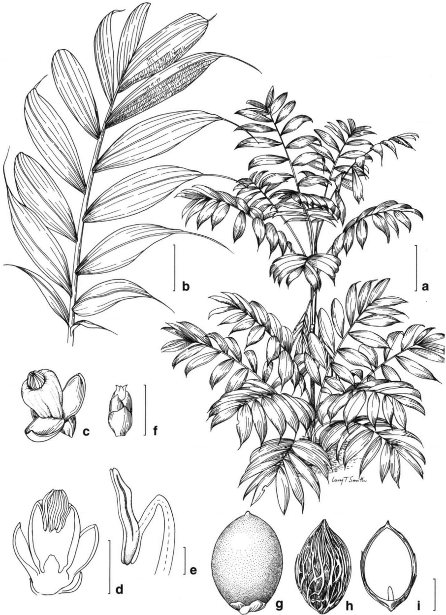
Fig. 3. Calyptrocalyx doxanthus Dowe & M.D. Ferrero. a. Habit, with dominant stem and basal sucker; b. leaf, with blotching partially shown on only two pinnae; c. staminate flower; d. staminate flower in longitudinal section; e. stamen, extended, with vasculature indicated by a broken line; f. pistillate flower; g. fruit; h. fruit with epicarp removed to show mesocarp fibres; i. fruit in longitudinal section. — Scale bars: a = 30 cm; b = 8 cm; c & f = 4 mm; d = 3 mm; e = 1 mm; g–i = 5 mm ( Hambali s.n. ). Drawing by Lucy T. Smith.