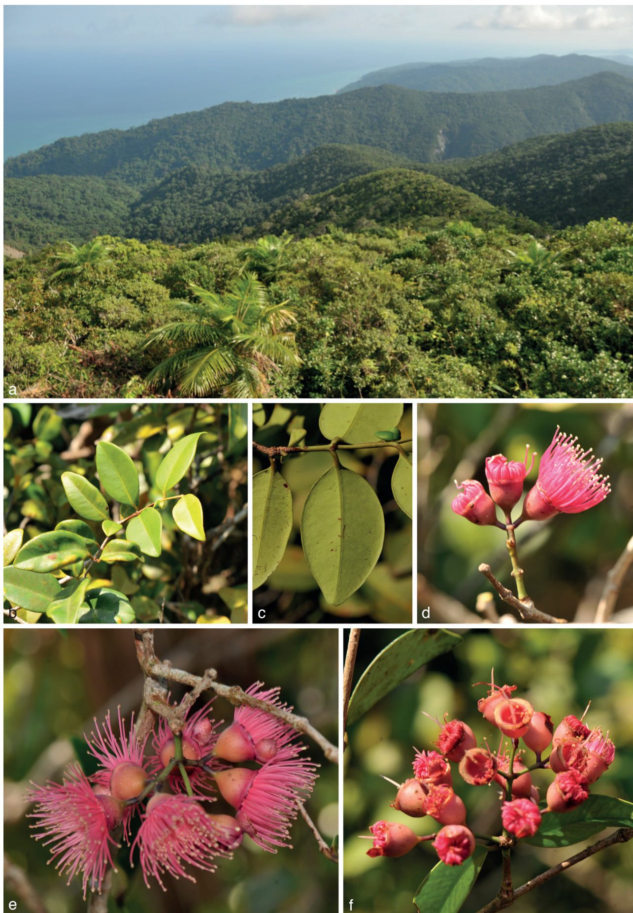
Fig. 1 Syzygium hookeri M.V.Ramana, Chorghe, Venu. a. Habitat; b. twig; c. lower side of leaf; d–f. inflorescence on leafless/leafy lateral twigs.