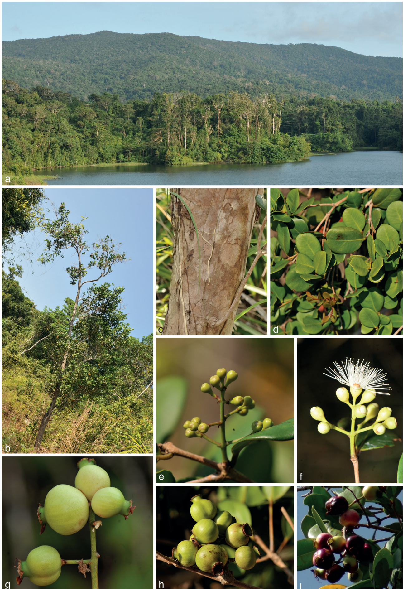
Fig. 3 Syzygium sanjappaiana M.V.Ramana. a. Habitat; b. habit; c. portion of the stem showing bark; d. leaves; e, f. inflorescence; g–i. berries unripened/ripened.