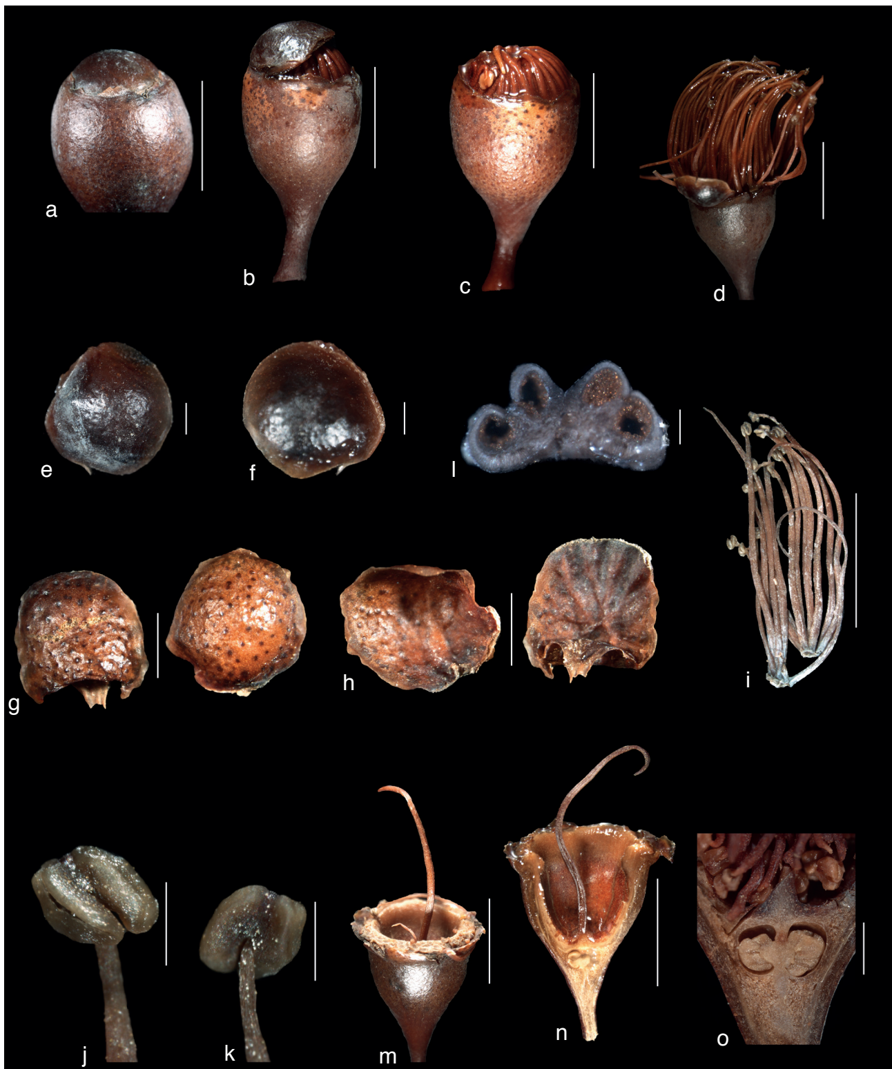
Fig. 4 Syzygium sanjappaiana M.V.Ramana. a, b. Flower bud with calyptra and pseudocalyptra; c. flower bud after separation of calyptra and pseudocalyptra; d. open flower; e, f. calyptra dorsal and ventral sides; g, h. petals dorsal and ventral sides; i. stamen bundles; j, k. anther lobes ventral and dorsal sides; l. anther sacs; m. hypanthium with style; n. hypanthium longitudinal section; o. ovary longitudinal section.