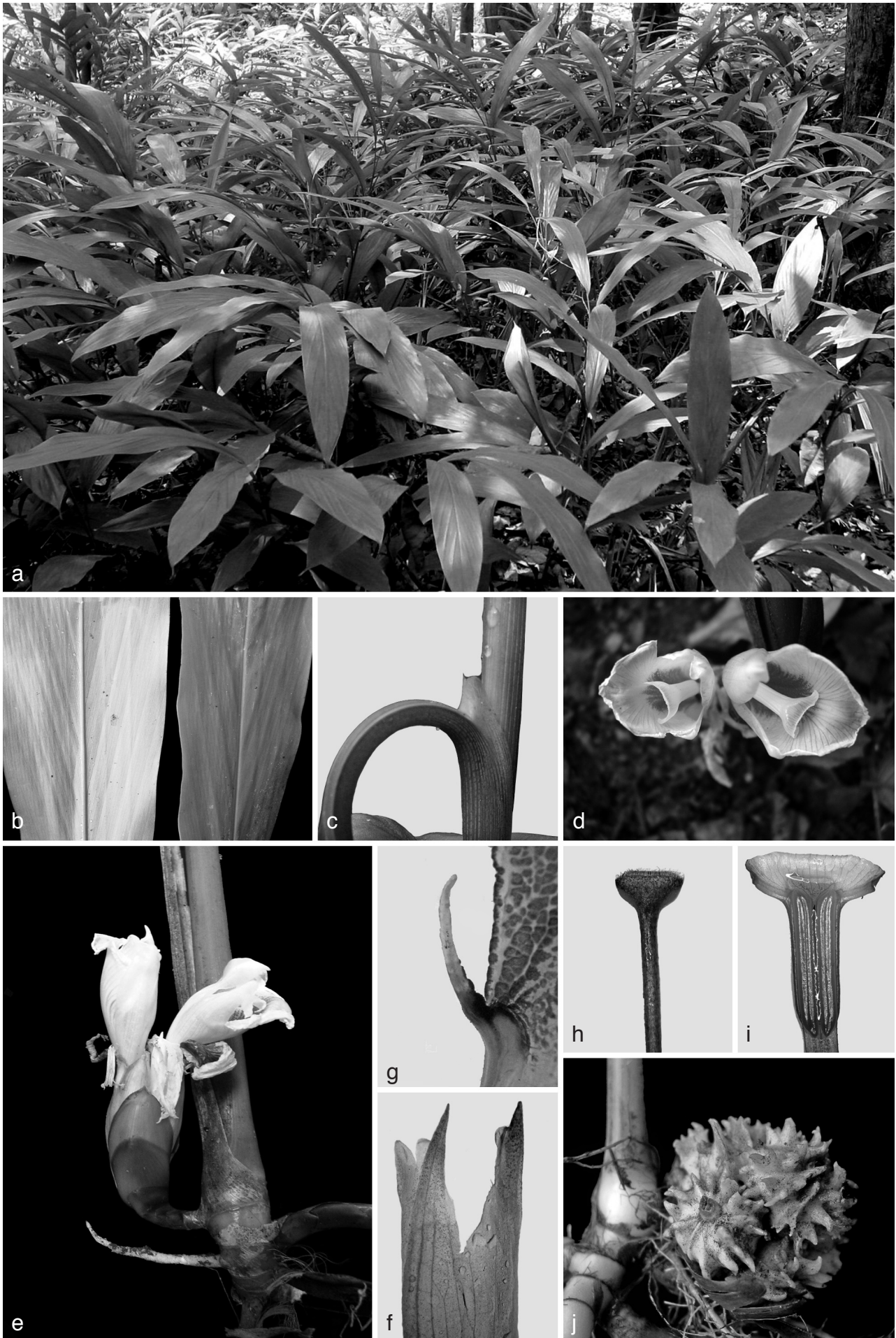
Plate 1 Amomum andamanicum V.P.Thomas, M.Dan & M.Sabu. a. Population of plants under cultivation; b. ventral and dorsal surfaces of leaves; c. ligule; d, e. inflorescence; f. calyx; g. lateral staminode; h. stigma; i. anther with crest; j. infructescence.