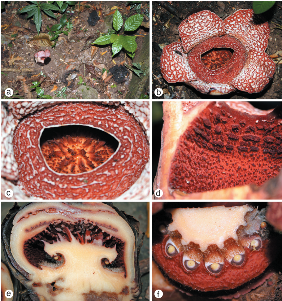
Plate 1. Rafflesia banahaw Barcelona, Pelsler & Cajano. a. Habitat showing flower just opening (left) and senescent flower (right); b. a newly-open male flower; c. diaphragm opening through which is visible the processes on the top surface of the disk; d. ramenta on the inner surface of the diaphragm and perigone tube; e. column (cut surface of neck at bottom) showing anthers below the disk corona; f. longitudinal section of a male floral bud (a–d, f: Barcelona, Cajano & Mendua 3345 (holotype); e: Barcelona, Cajano & Mendua 3345 (isotype)).