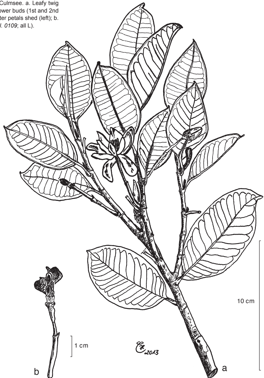
Fig. 1 Magnolia sulawesiana Brambach, Noot. & Culmsee. a. Leafy twig with flowers in four different development stages: flower buds (1st and 2nd to the right), open flower (middle) and young fruit after petals shed (left); b. ripe fruit (a. Brambach et al. 1334, b. Brambach et al. 0109; all L.).

petioles, yellowish green (reddish brown when dry), glabrous, cigar-shaped, flattened and usually twisted, becoming up to 6 cm long, caducous, leaving white contrasting annular scars. Leaves glabrous except for a line of brown (pale when dry), erect, villous hairs running through the adaxial petiole groove to about the middle of the abaxial side of the leaf blade on both sides of the midrib, conspicuous in young leaves, glabrescent but often some hairs persistent; spirally arranged, usually oblong, elliptic or (narrowly) obovate (rarely narrowly ovate), the midrib arching downwards, V-shaped in cross section (midrib usually distorted when dry), (5–)6–9(–11) by (2.5–)3–4.5(–6.5) cm, ratio (1.6–)1.9–2.2(–2.4), margin entire, revolute, not thickened; base rounded to obtuse (to acute), slightly asymmetric, apex rounded to obtuse (to acute), with a short triangular, usually contorted acumen (c. 1–3 mm); coriaceous shiny green above (pale greenish brown to reddish brown when dry), paler beneath, (darker golden-brown to chestnut when dry); midrib flat and narrow above, round and strongly prominent beneath, yellowish green on both sides (concolorous with leaf blade above, chestnut and darker than leaf blade beneath when dry), running up to the very tip, there often forming a tiny, inconspicuous mucro; lateral veins (13–)15–18(–20) per side,