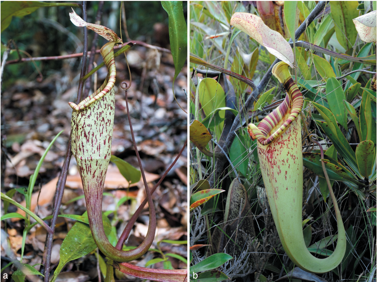
Fig. 1 a. Upper pitcher of N. baramensis C. Clarke, J.A. Moran & C.C. Lee, Brunei. Note the funnel-shaped lower portion of the pitcher, distinct hip, and cylindrical upper portion. The waxy zone of this pitcher occupies the cylindrical portion on the inner surface. In this example, the peristome is raised slightly at the front of the mouth. This feature is generally absent or greatly reduced in N. baramensis . – b. An upper pitcher of N. rafflesiana Jack from Johor, Peninsular Malaysia. The pitcher is funnel-shaped throughout, the hip is visible only at the front of the pitcher, and is located immediately beneath the peristome. There is no waxy zone inside the pitcher.