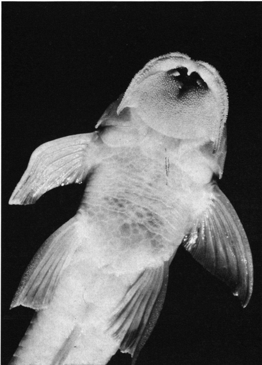
Fig. 1. Metaloricaria paucidens nijsseni (Boeseman, 1976), anteroventral view of a specimen in ZMA 106.334, SL 255 mm showing the mouth and lips which are characteristic of the genus (reproduced from Nijssen, 1970: 13).

5.0-10.7 in Harttiina). The posterior margin of the lower lip is convex medially, concave at either side towards the maxillary barbel. Upper and lower lips, together with the maxillary barbels, form a horseshoe-like outline (fig. 1), in contrast to the oval to roundish outline of the lips in the Harttiina; the lip shape of Metaloricaria is unique among the Loricariidae. On the surface of the lip inside the buccal cavity (between the