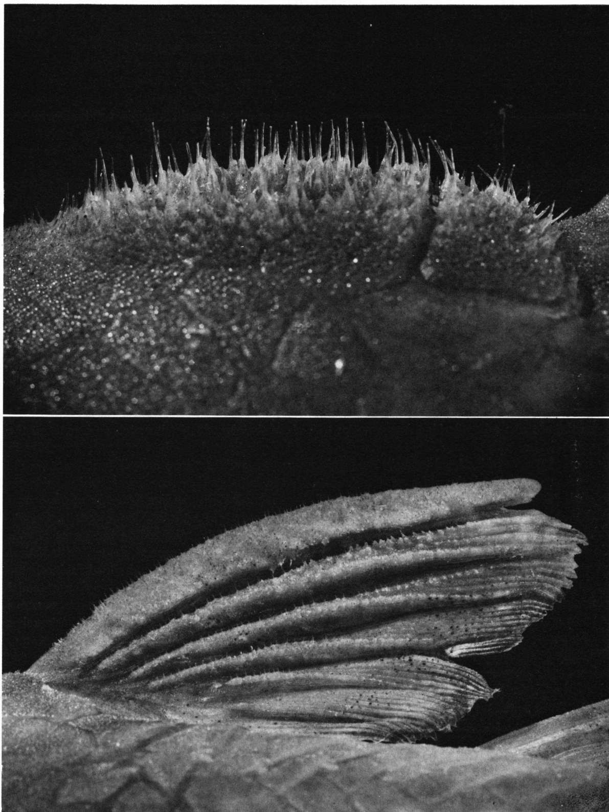
Fig. 2. Metaloricaria paucidens nijsseni (Boeseman, 1976), ♂ in ZMA 106.334, SL 256.1 mm, showing secondary sexual dimorphism, viz., enlarged odontodes along the side of the head and on the dorsum of the pectoral fin.