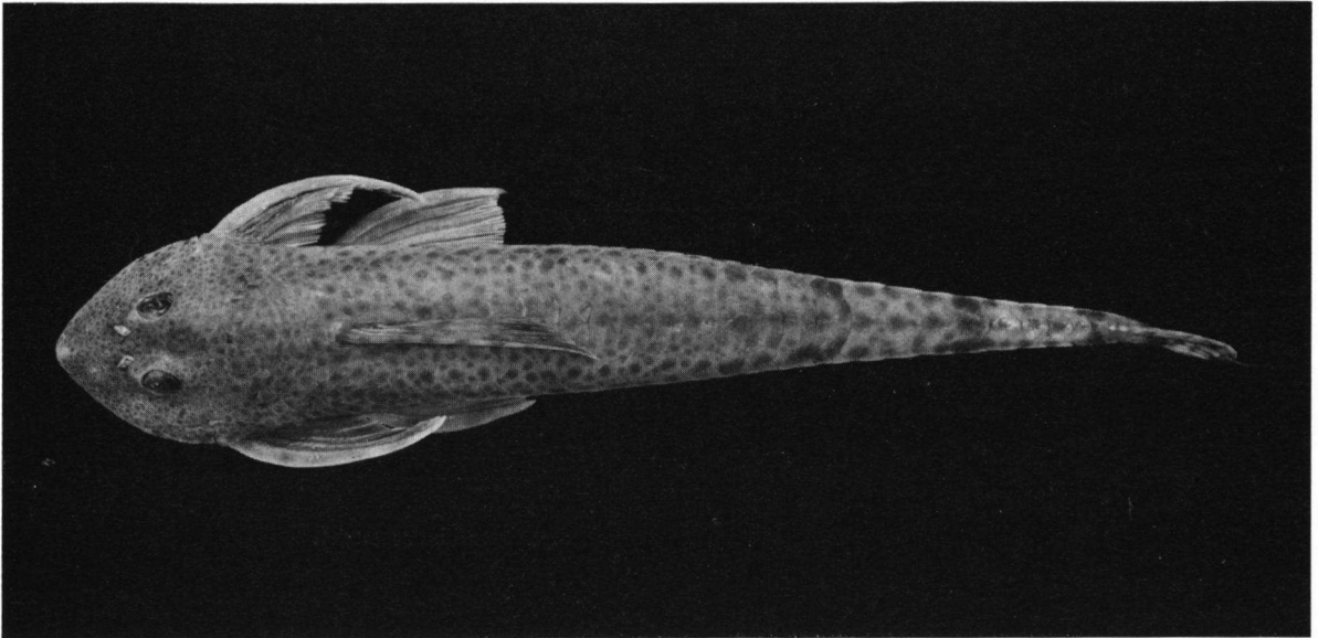
Fig. 3. Metaloricaria paucidens paucidens Isbrücker, 1975, paratype in ZMA 112.741, SL 234.5 mm (♂ from Saut Alicoto, upstream of Camopi, Oyapock River basin), showing the colour pattern on the dorsum of the body and head, characteristic of the subspecies.