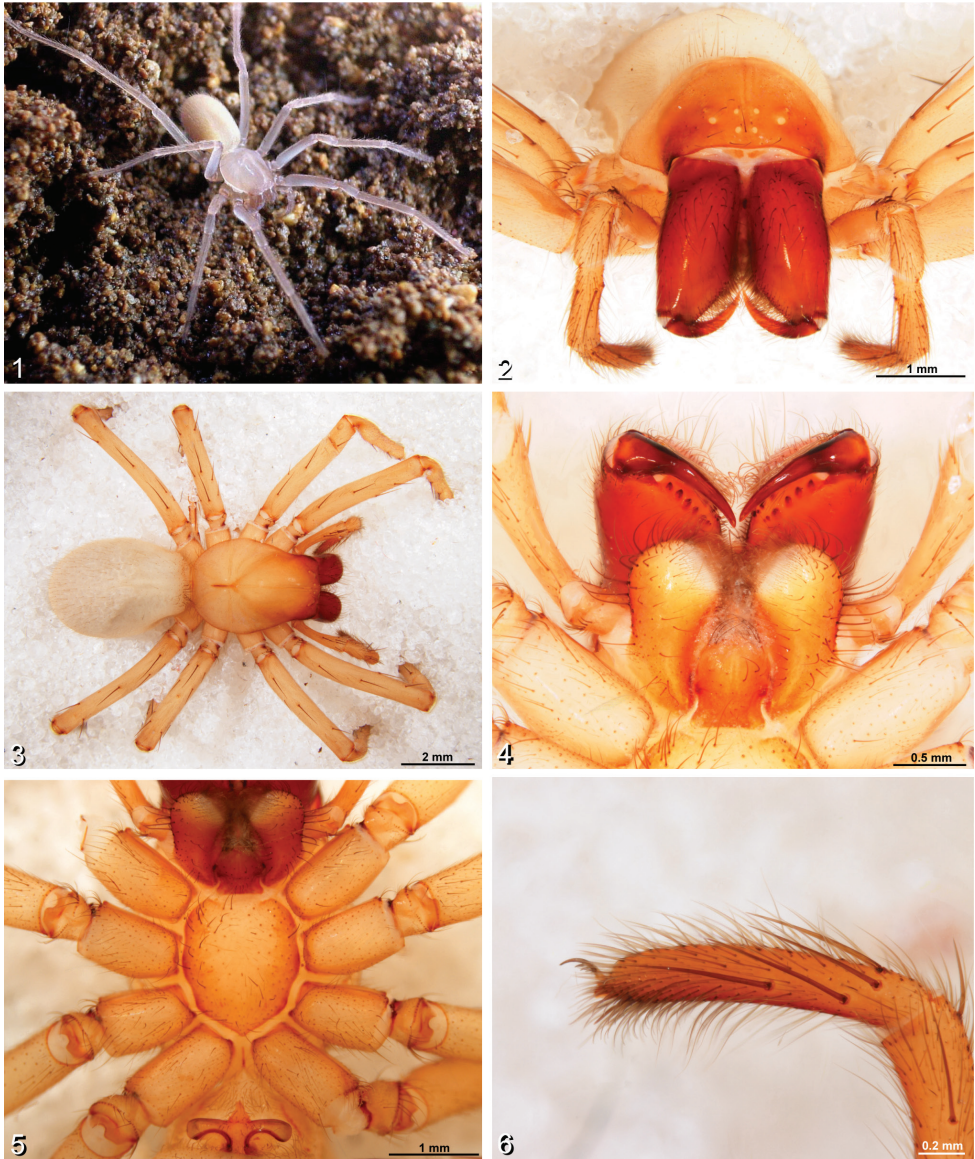
Figures 1–6. Amauropelma matakecil sp. n. 1 female habitus 2–6 habitus of female holotype (MZB. Aran.500) 1 Portrait of live specimen in natural habitat from Gua Nguwik, Central Java 2 Anterior view 3 Dorsal view 4 Ventral view showing labium, endites, and chelicerae 5 Ventral view showing sternum, coxae, and trochanters 6 Left pedipalpal, retrolateral view.

plate with long, narrow lateral wings with concave posterior margins. Epigynal teeth sclerotized, arise posterior to lateral wings (Fig. 7). Copulatory openings on dorsal surface near lateral margins of wings, follow posterior margin of wings to reniform spermathecae (Fig. 8).