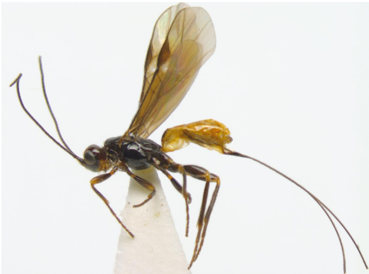
Fig. 1. Coeloides filiformis Ratzeburg (Braconidae: Braconinae).

also yielded surprises, such as the discovery of relatively closely related genera that differ in such important aspects as syncytial versus holoblastic cleavage, normally characterizing major animal phyla (Grbic & Strand, 1998; Grbic, 2000)! Parasitism of adult insects (especially of Hemiptera and Coleoptera) is also known, and members of three subfamilies (Mesostoinae, Rhyssalinae and Doryctinae) form galls on plants (Infante et al., 1995; Austin & Dangerfield, 1998). Several excellent general reviews of braconid biology are available (Matthews, 1974; Shaw & Huddleston, 1991; Shaw, 1995; Wharton, 1993).